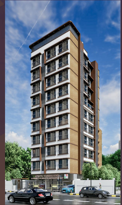
Mangalkarini Sky Breeze CHSL Goregaon (W)